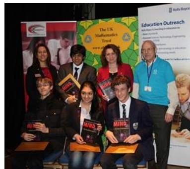
The Grammar School at Leeds