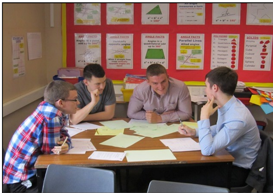
Photo: students from Heworth Grange School in Gateshead, doing some problem solving activities in preparation for the STMC .

If you are interested in any of the support mentioned please contact one of the Region's Area Coordinators - details can be seen below.